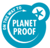
Petrol blue on a white background

Preferably - especially when smaller than 20 mm wide - use the original, petrol blue logo on a white background with a white environment.