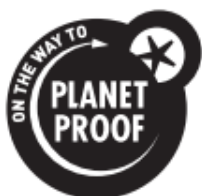
Black on a white background