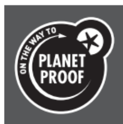
Black on a dark background